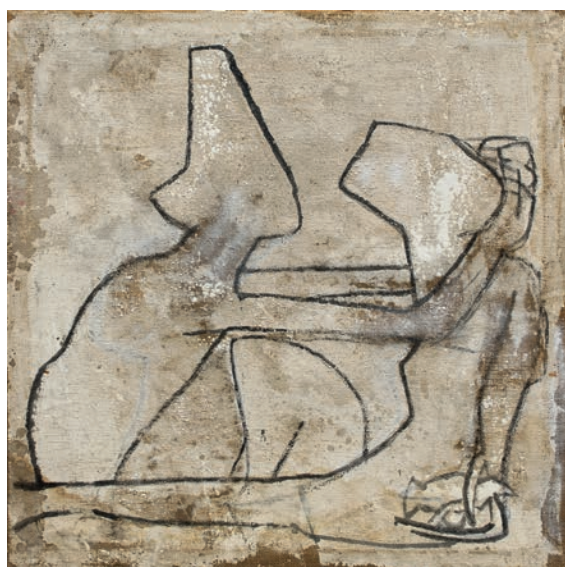
Roberto Matta, Untitled, 1972, mixed media on canvas, 110 x 110 cm / 43.31 x 43.31 in. © ADAGP, Paris, 2018.