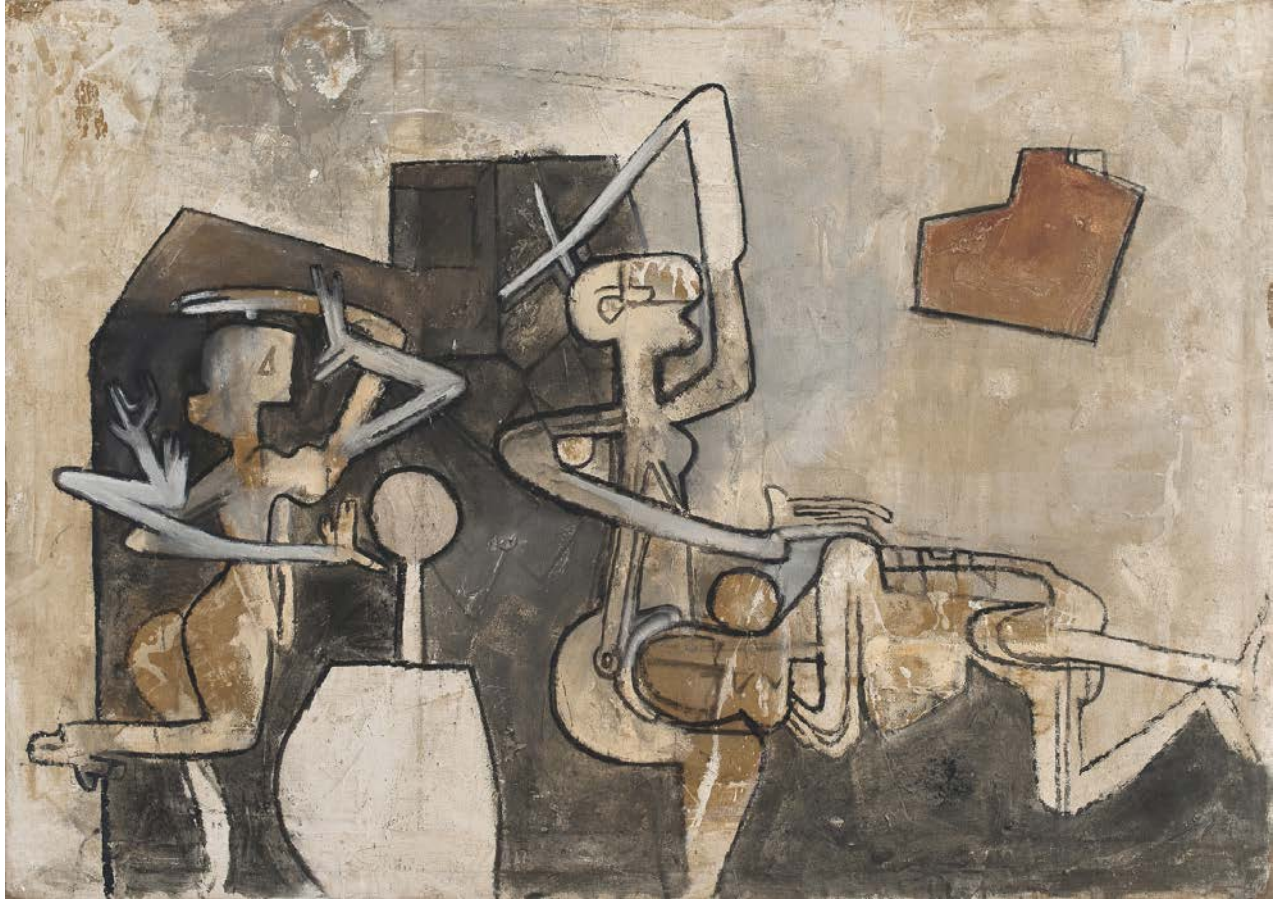
Roberto Matta, 'La Question', 1958, mixed media on canvas, 202 x 287 cm / 79.53 x 113 in.

During this volatile post-war era, deeply wounded by horror, Matta personally distanced himself from the simple, homogenous representation of the world. With his strong, ever-present political conscience, he took a stand in many political discussions. For example, his denouncement of the torture perpetrated during the Algerian War was clearly visible in his painting, La Question (1958). La Question was a direct reference to the eponymous book, which had been immediately censored upon publication.