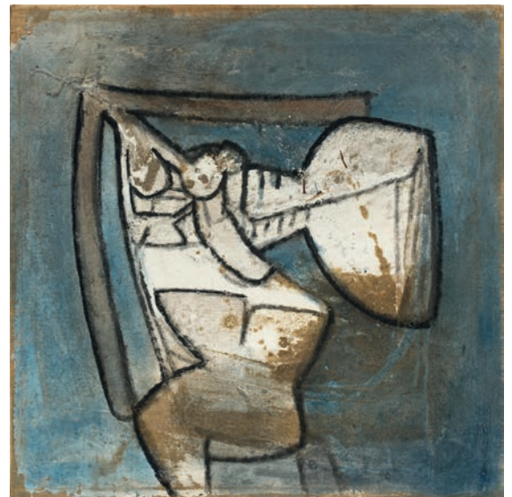
Roberto Matta, 'Untitled', circa 1963, mixed media on canvas, 100 x 100 cm / 39.37 x 39.37 in. © ADAGP, Paris, 2018. Photo – Galerie Diane de Polignac, Christian Demare.

In Matta's words, "You paint on an easel, you're still painting what you see. You have to put the canvas on the ground and paint what you feel."