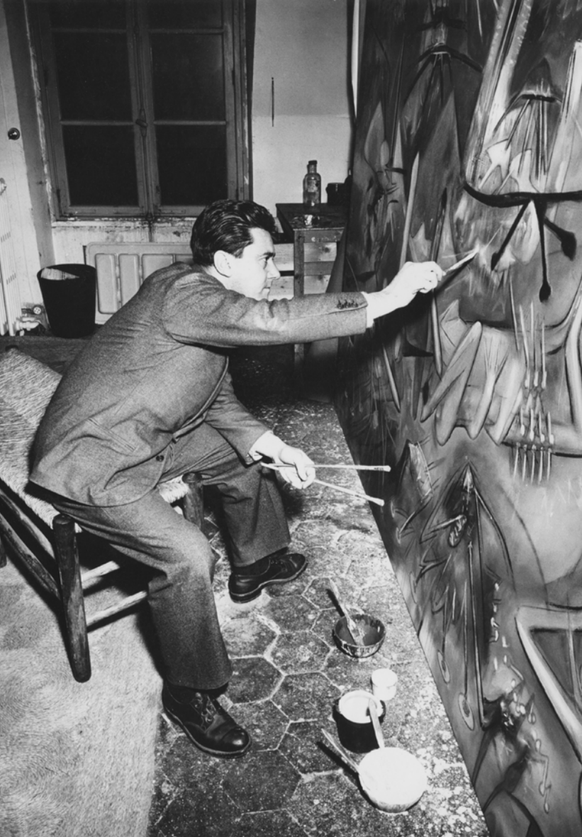
Roberto Matta in his studio, Paris, circa 1954.