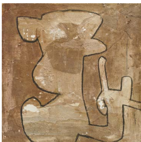
Roberto Matta, Untitled, circa 1963, mixed media on canvas, 100 x 100 cm / 39.37 x 39.37 in. © ADAGP, Paris, 2018.