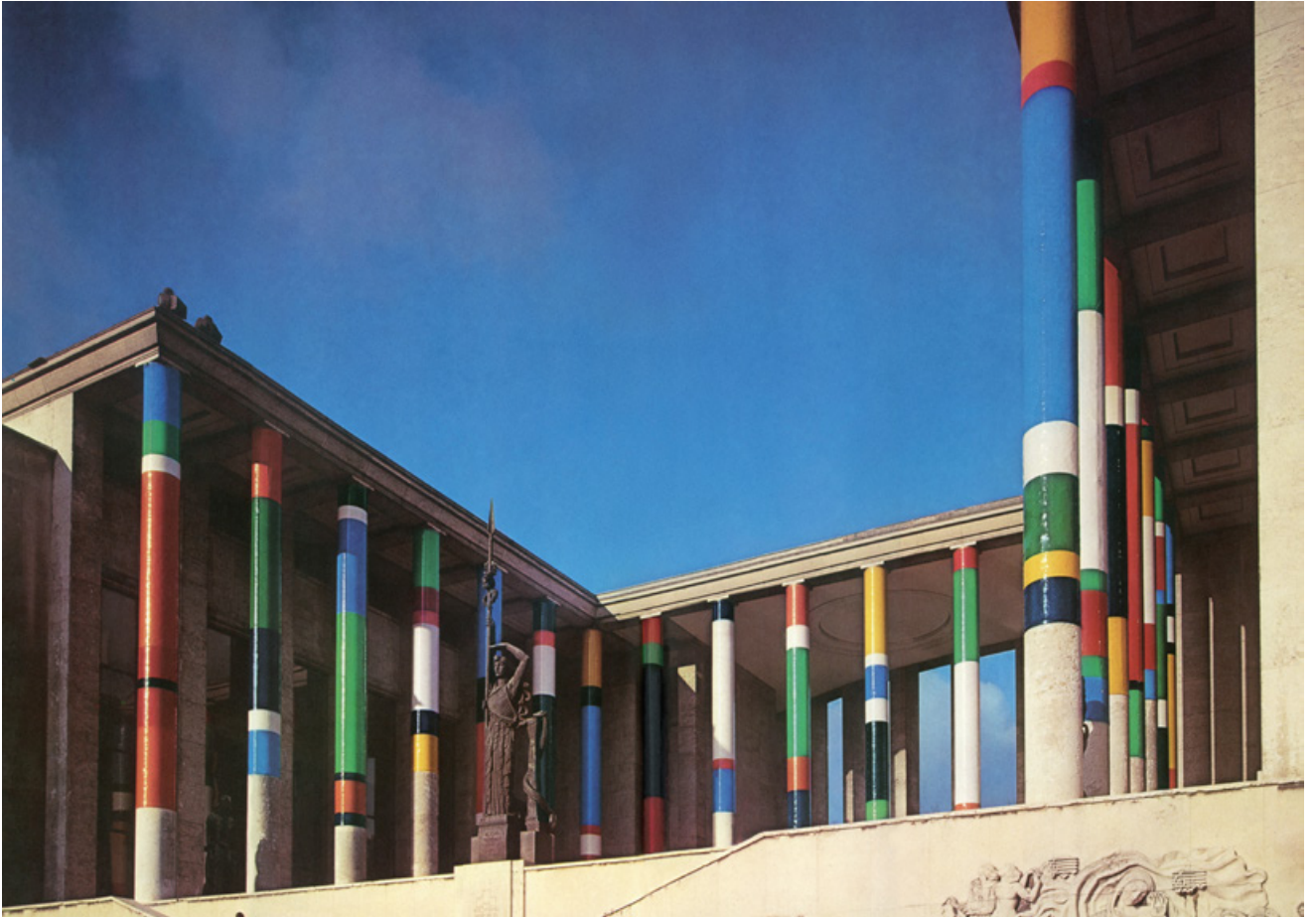
Mise en couleurs d'un Musée, Musée d'Art moderne de la Ville de Paris, 1974

In 1965 he spent a year in New York where he met Andy Warhol and Robert Indiana.