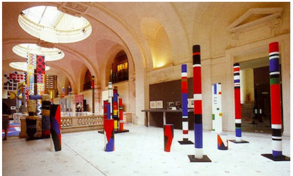
Retrospective, Musée des Arts Décoratifs, Paris, 1990

A fascinating dialogue between Rougemont’s Totem and the Venetian architecture.