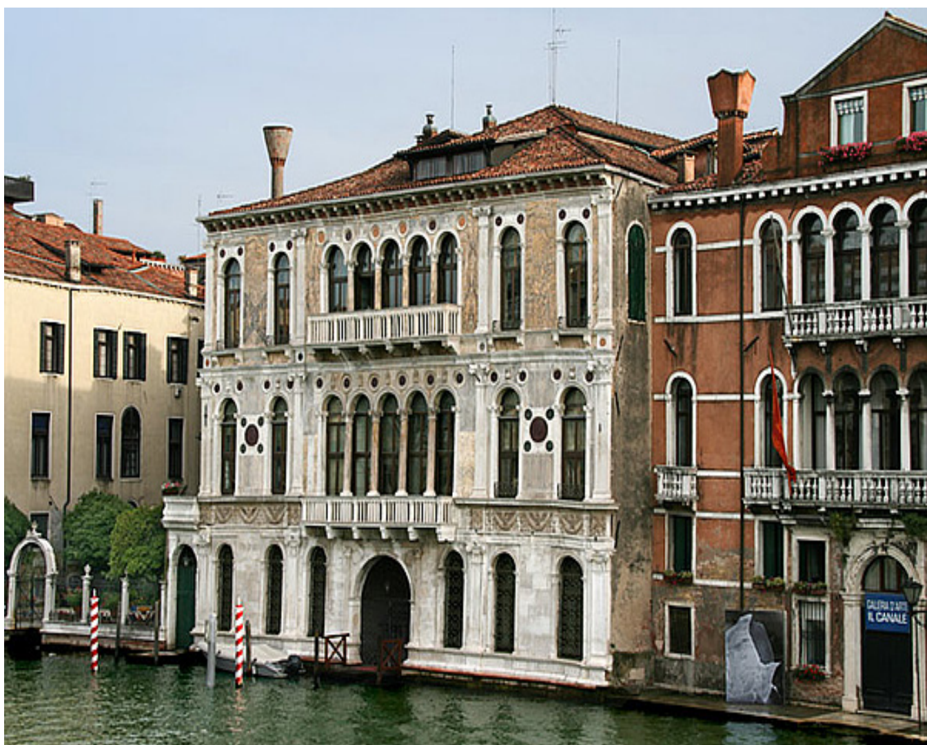
Palazzo Contarini Polignac

Opening: October 17, 2019 Exhibition: October 19 - November 30, 2019