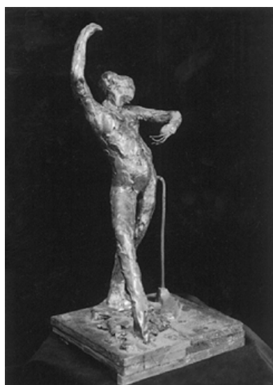
Edgard DEGAS Étude pour la danse espagnole , between 1834 and 1917 Wax statuette, 45,2 x 21 x 19,5 cm Musée d'Orsay, Paris