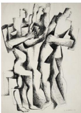
Ossip ZADKINE Le retour du fils prodigue , 1946 India ink on paper, 75 x 54 cm Musée national d'Art moderne, Centre Pompidou, Paris