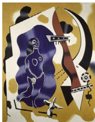
Fernand LÉGER La danseuse bleue , 1930 Oil on canvas, 146,5 x 114 cm Musée national d'Art moderne, Centre Pompidou, Paris