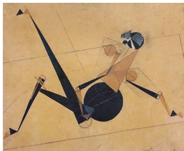
Henri LAURENS Joséphine Baker , 1915 Collage, gouache and pencil on paper, 22,5 x 28 cm Musée national d'Art moderne, Centre Pompidou, Paris