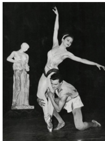
Zizi Jeanmaire and Wladimir Skouratoff, c. 1955