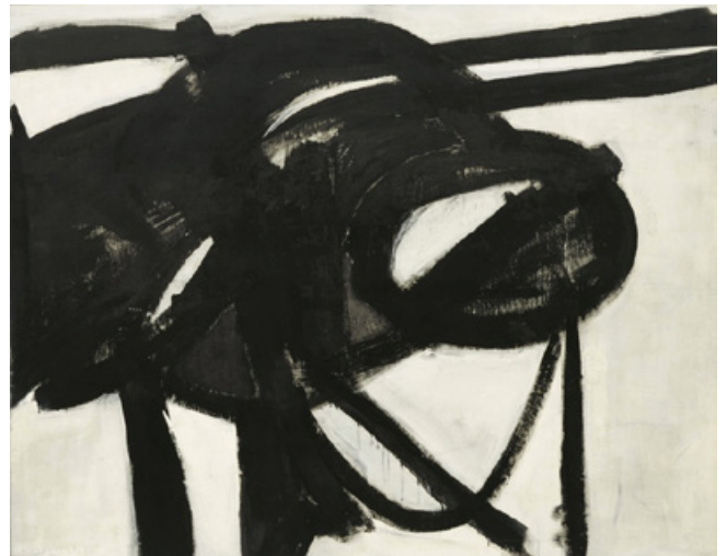
Franz KLINE Chief , 1950 Oil on canvas, 148 x 186 cm Museum of Modern Art, New York