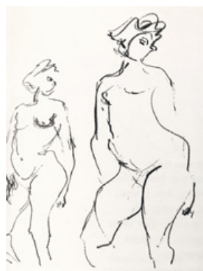
Jean MIOTTE Étude de nu , 1948 Graphite