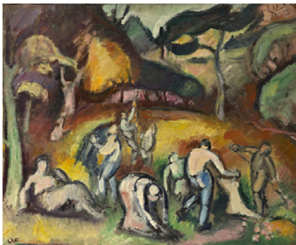
Émile Othon FRIESZ L'automne , 1908 Oil on canvas, 53 x 64 cm Musée d'Art moderne de Paris, Paris