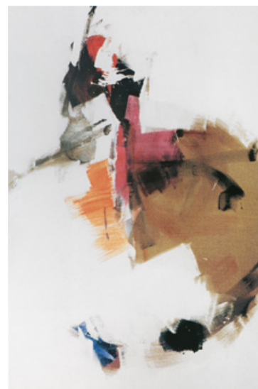
Jean MIOTTE Ronde cosmique , 1972 Acrylic on canvas, 195 x 130 cm Fonds national d'art contemporain, Paris – La Défense