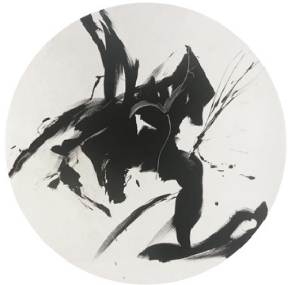
Jean MIOTTE Excalibur 1997 Acrylic on canvas, diameter 130 cm Collection Chelsea Art Museum, New York

Jean Miotte received a commission from the city of Paris: a large format work titled Sud which hangs in the main hall of the Bastille Opera House. The writer Castor Seibel wrote about Jean Miotte's painting: "Beyond all realistic figuration, it is an event in itself that finds its expression in the gestural dynamic and its equivalence in colour... knowing how to combine the contradictory in the form seems possible for Miotte, serenity battles chaos, gentleness and the savage rub shoulders in happiness."