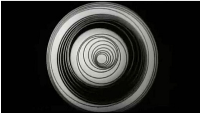
Marcel DUCHAMP Anémique cinéma , 1926 Seven minutes film

Jean Miotte fit perfectly into the artistic context of the second half of the 20 th century where movement became important in painting with Lyrical Abstraction, Action Painting, Kinetic Art, Abstract Expressionism, performance and so on. This interest was doubtless initiated by Marcel Duchamp with Anémic Cinema , an experimental film from 1926 in which optical disks whirl for seven minutes.