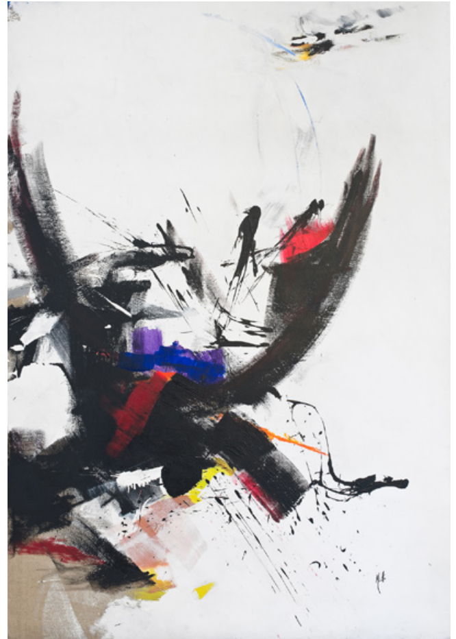
Jean MIOTTE Untitled , 1973 Acrylic on canvas, 190 x 130 cm Diane de Polignac Gallery, Paris

Jean Miotte is a French painter whose personal version of abstraction places him at the limit between Informal Art, Tachisme and Lyrical Abstraction.